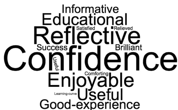
Figure 2 Postsimulation experience.

The purpose of the present study was to explore the efficacy of video-assisted self-reflection in a communication skills simulation. Students' initial responses highlighted realism as an important factor in the simulation experience.